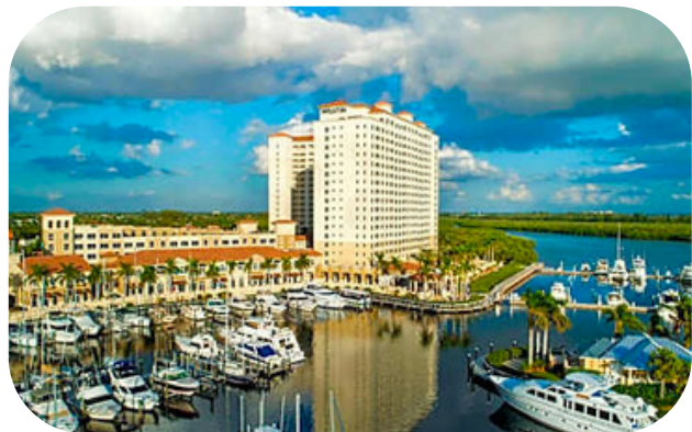
Exhibit and sponsorship opportunities for the 2026 FHEA Fall Expo & Education Conference ,

November 7 – 10, at the Westin Cape Coral Resort at Marina Village, will be available soon. Tabletops will be limited, so you won't want to miss out when registration opens.